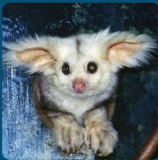
THE GREATER GLIDER

ALL LOCATED IN THE DITTMER & WHITSUNDAYS REGION