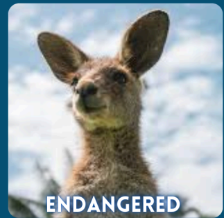
ENDANGERED PROSERPINE ROCK WALLABY