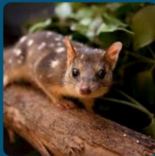
THE NORTHERN QUOLL